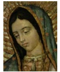
True Face of Mary Most Holy Our Lady of Guadalupe Queen of the Universe