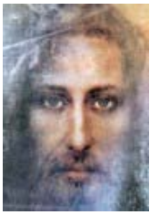
True Face of Jesus Christ King of the Universe